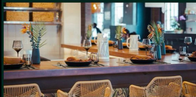
Ilé Bistro at Citizen Public Market