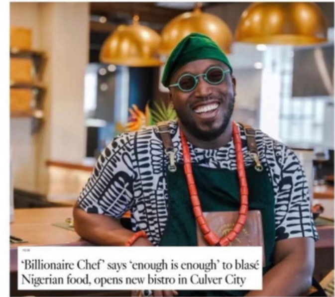
'Billionaire Chef' says 'enough is enough' to blasé Nigerian food, opens new bistro in Culver City