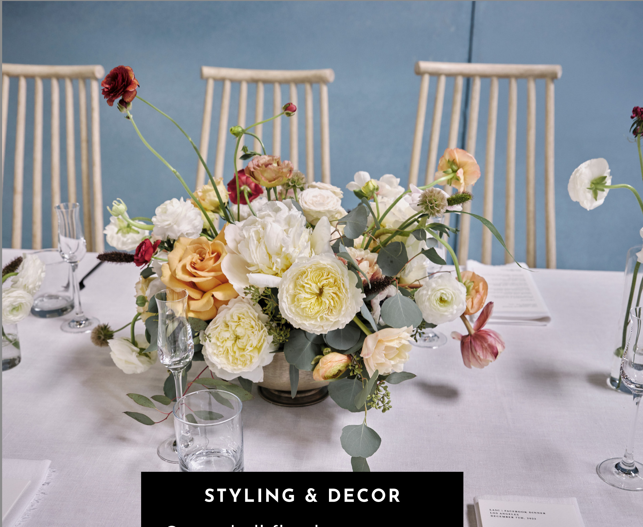
STYLING & DECOR Created all floral arrangement and curated tablescape elements.